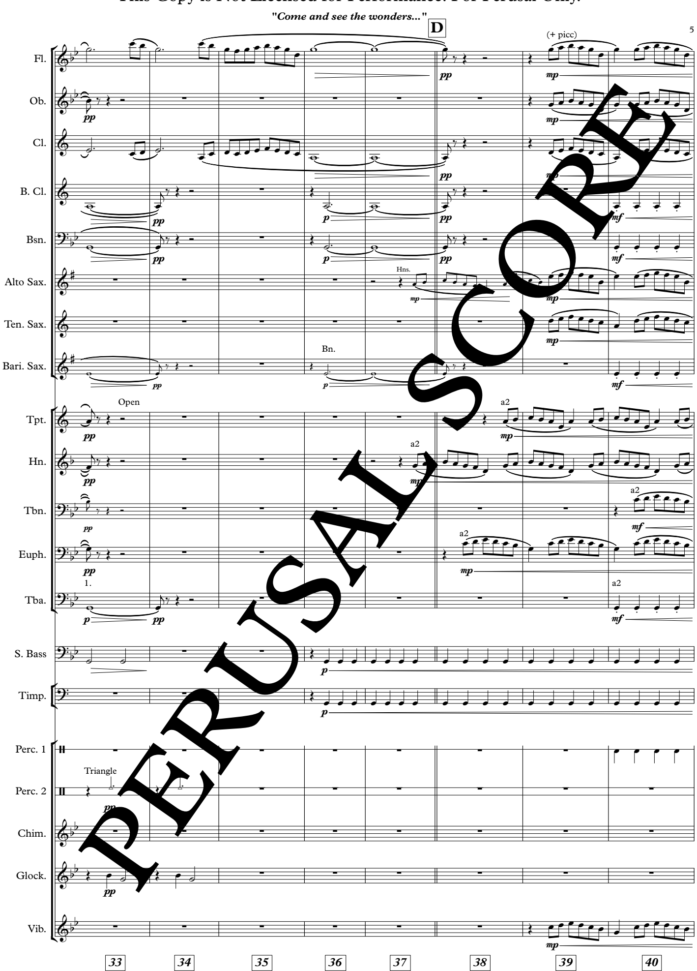
This Copy is Not Licensed for Performance. For Perusal Only.