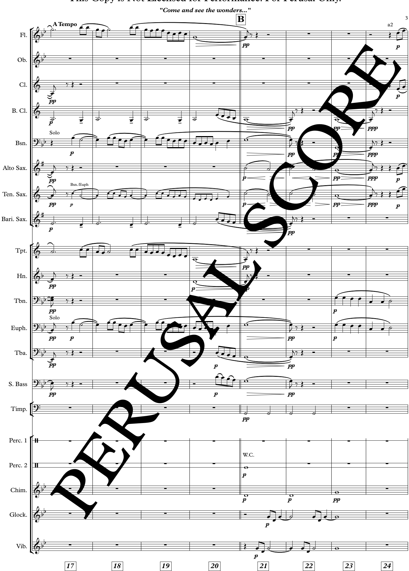
This Copy is Not Licensed for Performance. For Perusal Only.