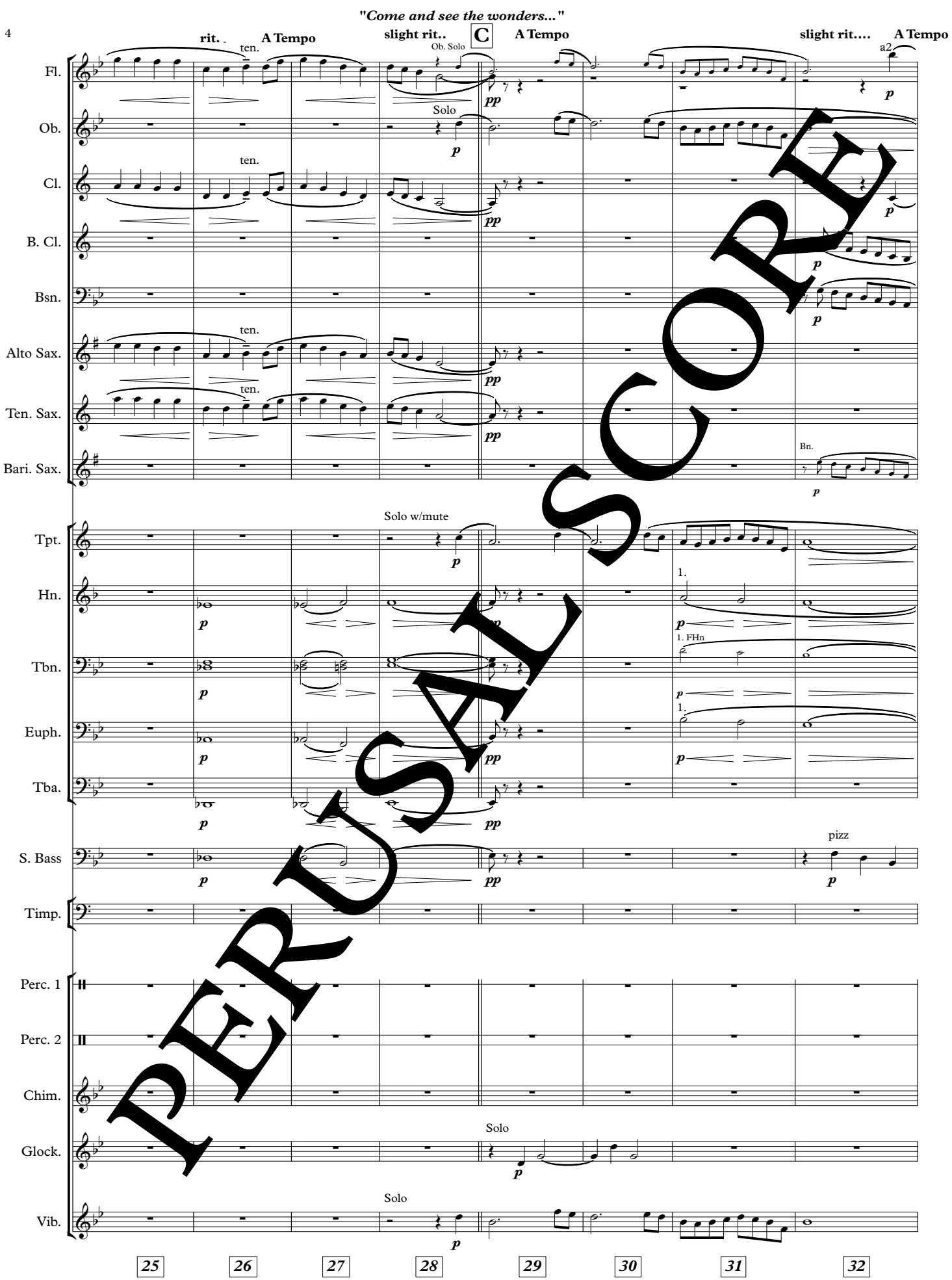
This Copy is Not Licensed for Performance. For Perusal Only.